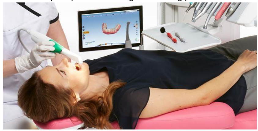
Planmeca Emerald Scanner in action

generally more comfortable for the patient. Additionally, if the dentist has the ability to mill in office, often time a crown and/or bridge can be made in the same appointment, eliminating the need for temporary crowns or bridges and saving you time and additional trips to the dentist.